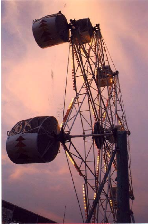
Ferris Ride at Twilight Pam Blaker 3 rd Place--Aug 2007