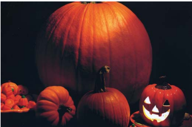
Pumpkins Janice Morris 2 nd Place --November 2008