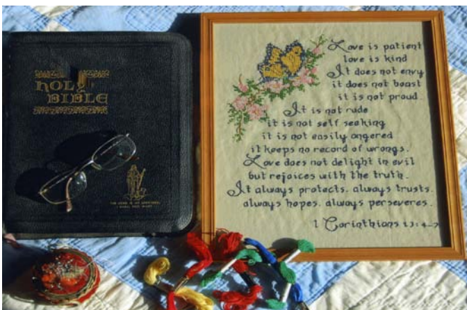
Wisdom Alan Butcher 2 nd Place