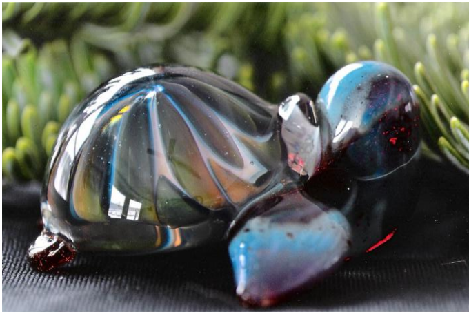
Reflections By Cathy Butcher