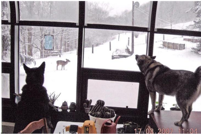
Scouting Dinner