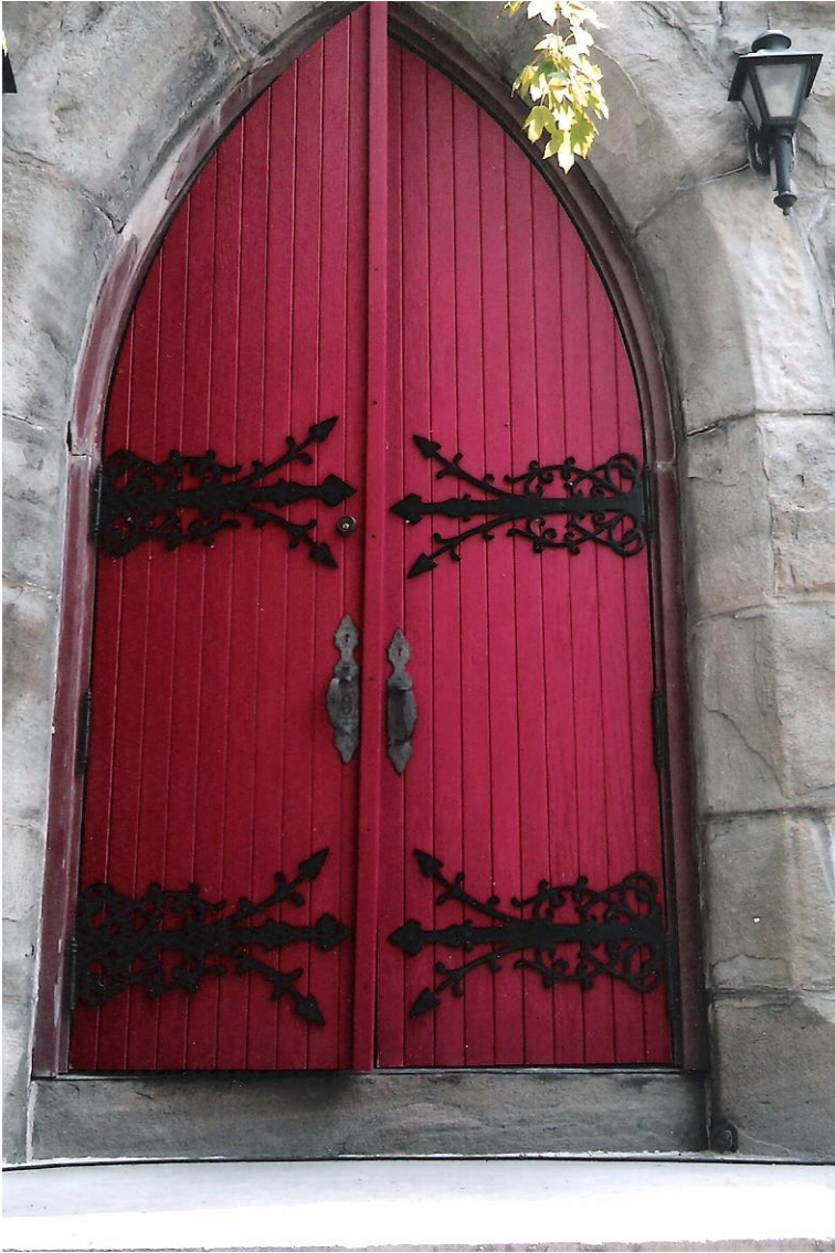
Second Place "Red Doors" By Kelly Sherrick