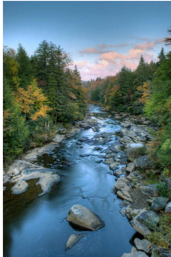
"Dusk at Blackwater River" By Alan Butcher

rityrats@hotmail.com awbs95@gmail.com jweaver2@windstream.net trainguy@windstream.net cmsb95@gmail.com yoskovich@windstream.net