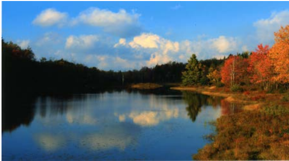
"Blackwater Lake" By Alan Butcher