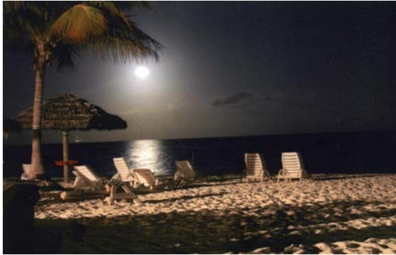
Dave Brendel August - Night Light