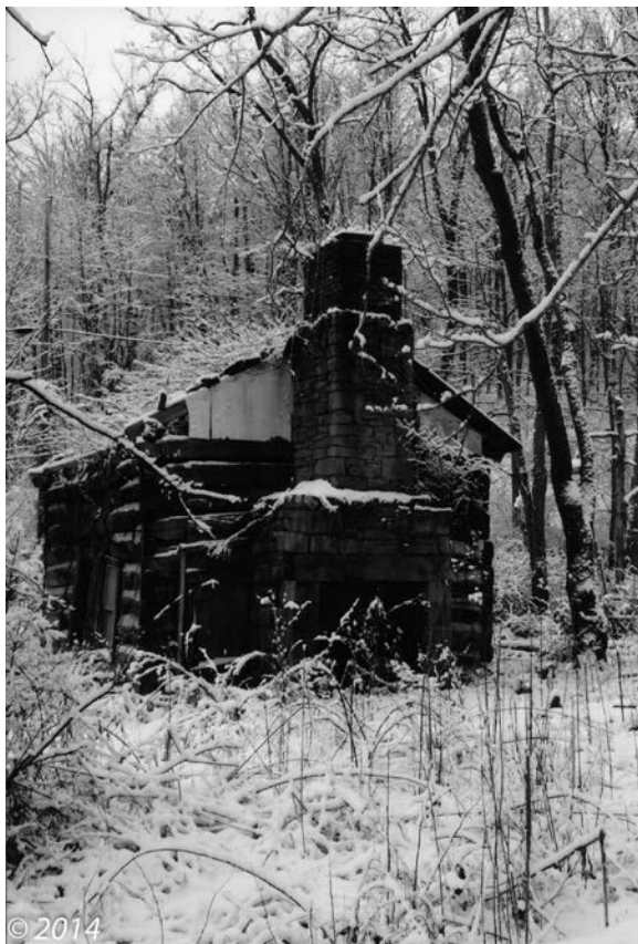
Kelly Scherrick January - Black & White