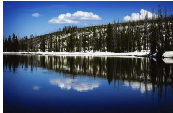
Bob Bedison September - Reflections