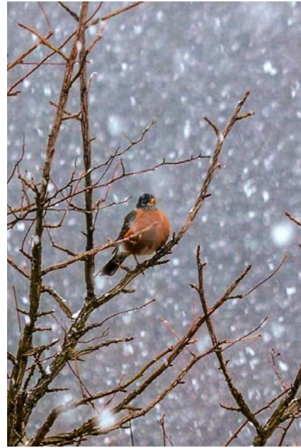
Cathy Butcher April (Tie) - Weather