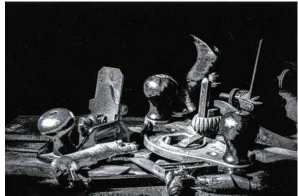
“A Day Gone By” By Cathy Butcher