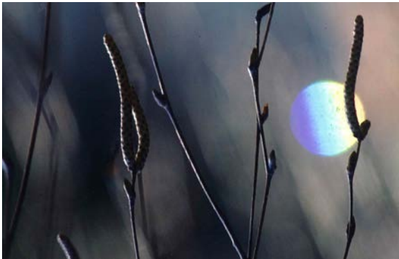
“A Window’s View” By Ann Newman