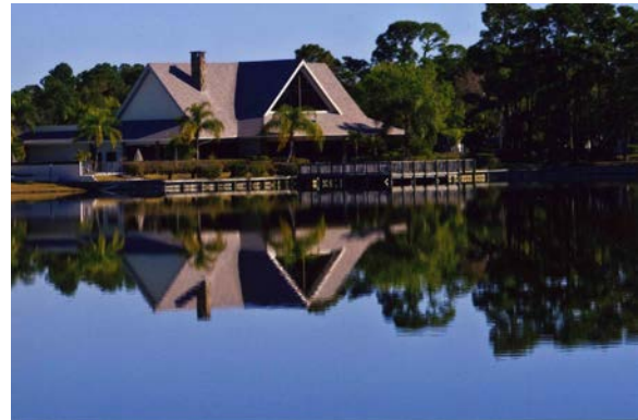
“Cocoa (FL) Reflections”