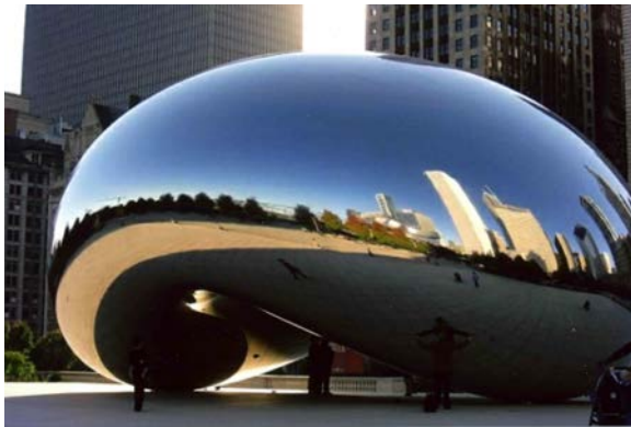
“Chicago’s Easter Egg”