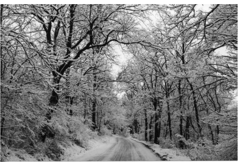
Kelly Scherrick, January 2014

https://digital-photography-school.com/ jumpstart-photography-start-365-project/