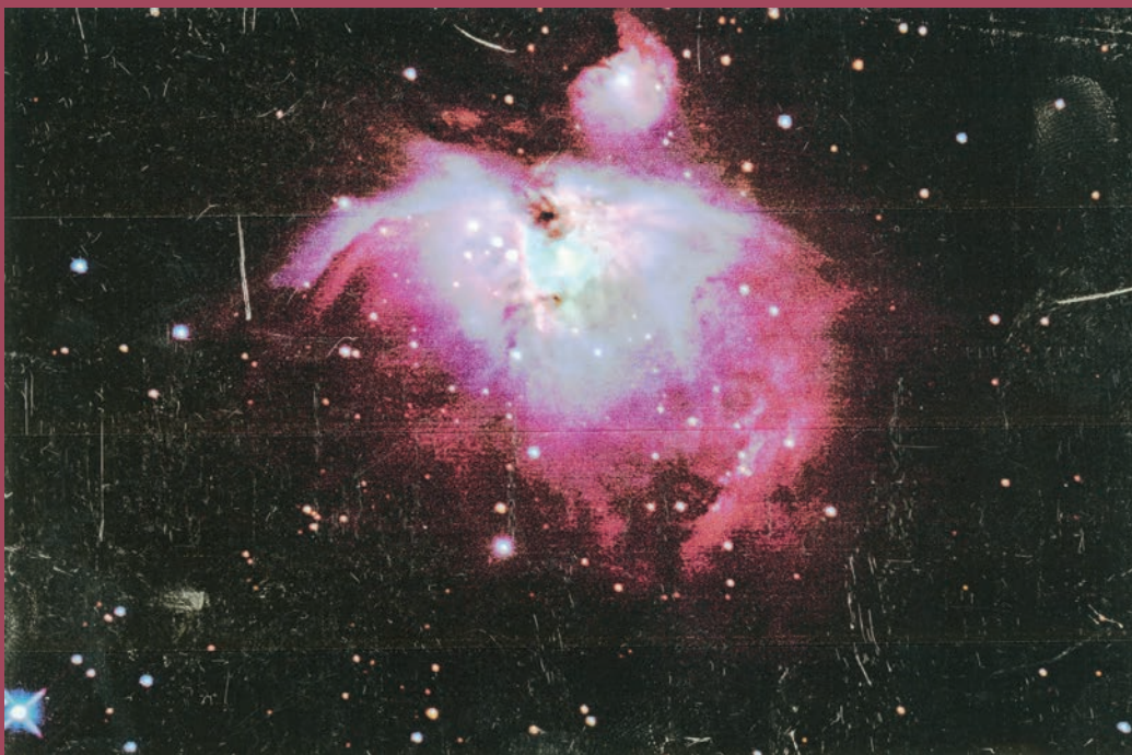
“Orion Nebula”

Next Meeting: 4th Tuesday, October 22 at 7 PM at the Waynesburg Bible Chapel.