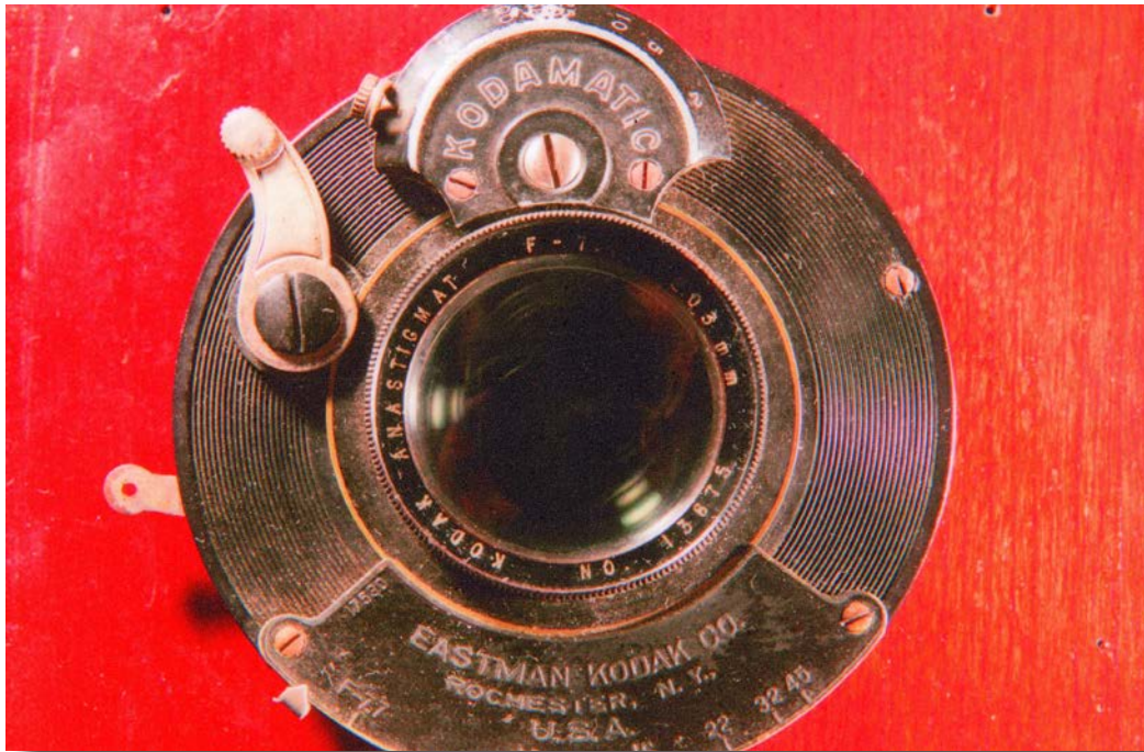
"Old Lens" by Chuck Beyer