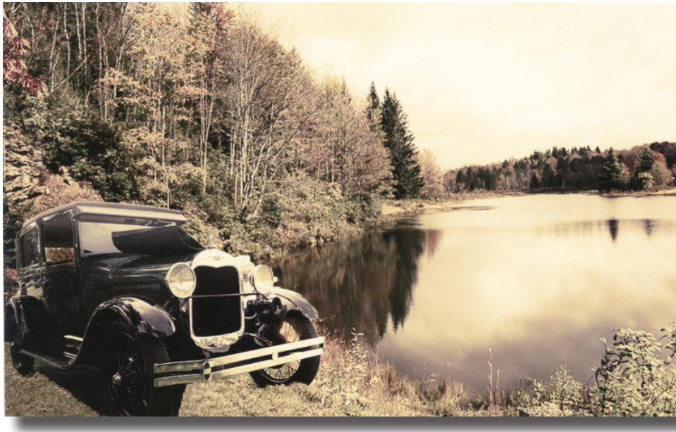
“Anything is Possible (with Photoshop)” by Cathy Butcher